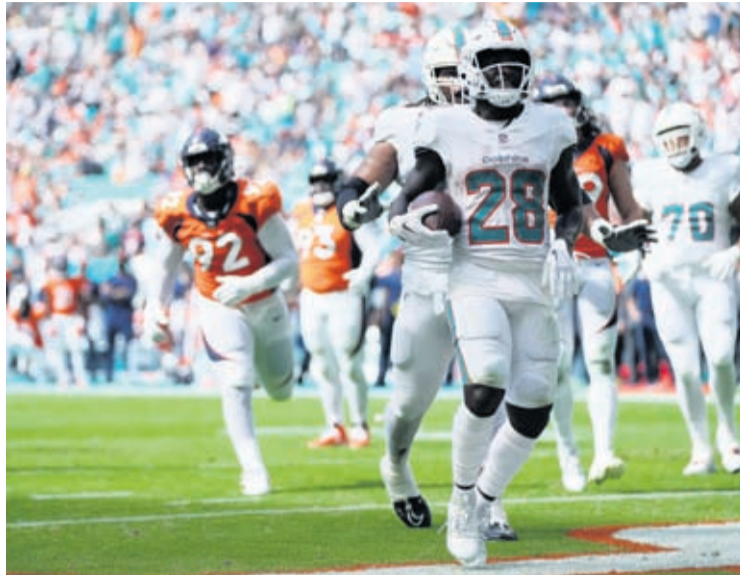
Miami Dolphins running back De'Von Achane (28) celebrates after scoring a touchdown during the second half of an NFL football game against the Denver Broncos, Sunday, Sept. 24, 2023, in Miami Gardens, Fla. The Dolphins defeated the Broncos 70-2

With a chance to become the first team since 1966 to top the 70-point mark